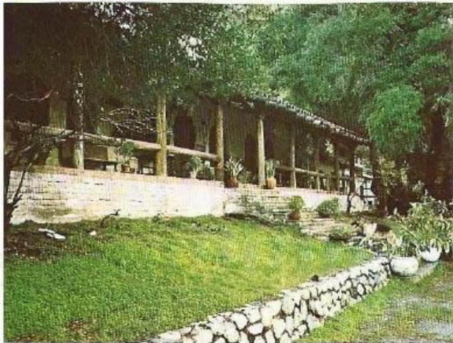
Spanish Hacienda at SABLE RANCH