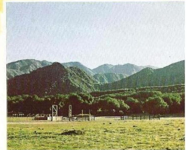
Meadow and Landing Strip at SABLE RANCH

Please call for reservations. Special rates for advertising agencies.