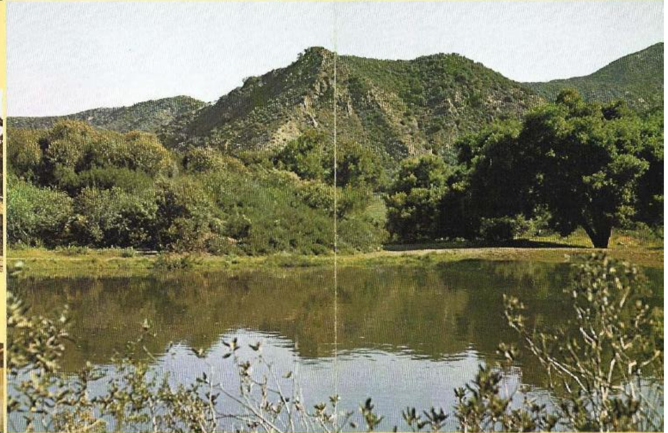
Mountain Lake adjacent to log cabin and barn