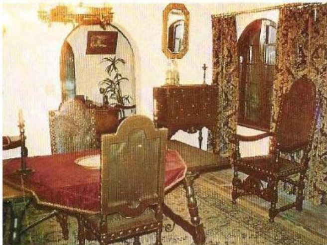
Interior of Hacienda