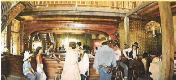
Saloon in "Western Town" at RANCHO MARIA Features 40 foot long bar