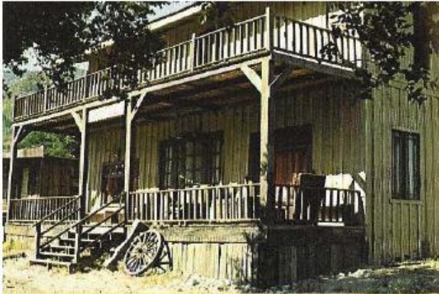
Hotel in "Western Town" at RANCHO MARIA