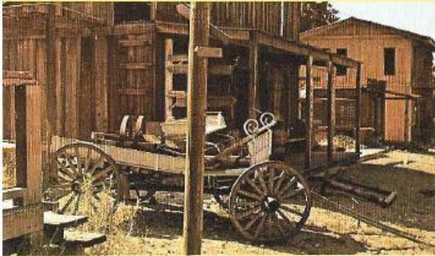
Street scene in "Western Town" at RANCHO MARIA